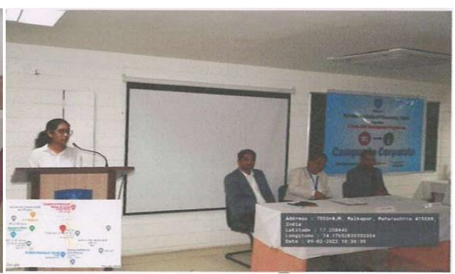
2. Non teaching training Programme "Conduct of Examination"

The programme started at 10.00 am and the venue of the programme was Media room. Total 15 non teaching staff attended the one day training session. Out of 15, 6 were office staff and 9 were supporting staff. The medium of instruction was in Marathi. The objective of conducting the administrative training programme was to inculcate or make the participants aware about roles and responsibilities of non teaching during conduct of examination.